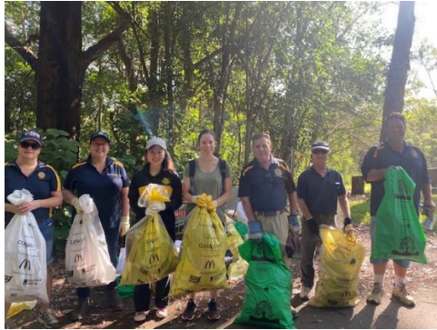
Clean Up Rotary style